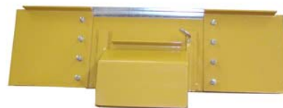
Single Liftgate Adaptor

The small opening allows operator greater control of flow into the hopper. An adjustment screw holds the door in a fixed position. Adjusts to fit a wide variety of door openings and can be easily removed when not in use. Double Lift Gate Adaptor helps to split wagon into two compartments.