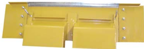
Double Liftgate Adaptor