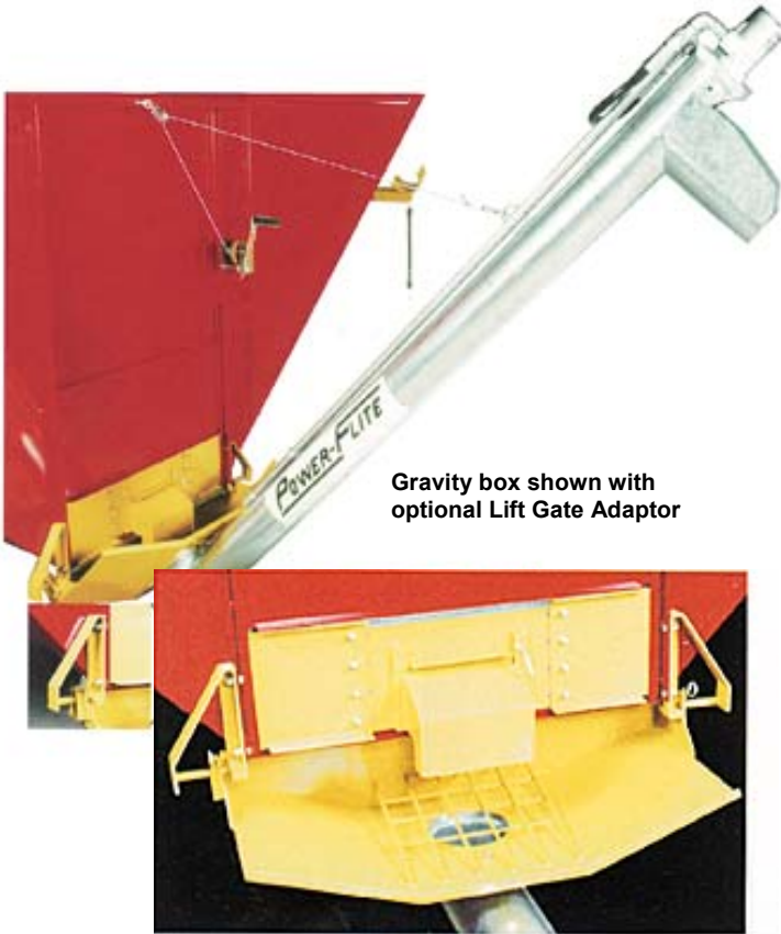
Gravity box shown with optional Lift Gate Adaptor

Quality Construction – Both the hopper and the flighting are heavy 10 GA steel. The center tube is 1" diameter high strength steel for years of trouble free operation.