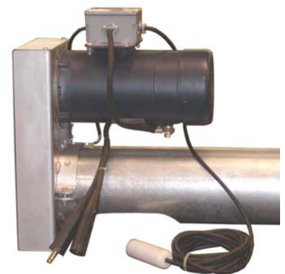
Electric Motor shown with solenoid and 15' pushbutton remote control

*Electric auger not to be used for fertilizer or with bristle