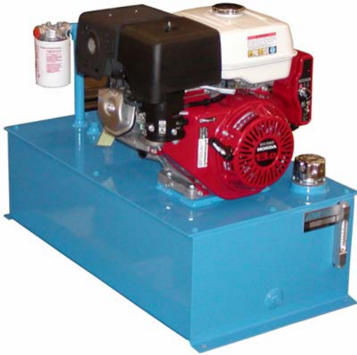
Model HP 13E